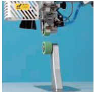
Standard Offset Pedestal